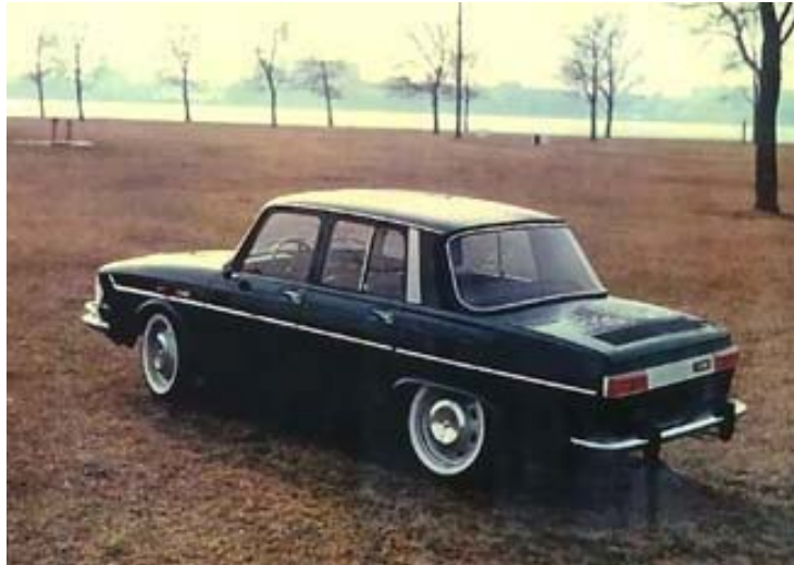
THE MARS II ELECTRIC CAR 146 miles range powered by patented Lead Cobalt Batteries

The remarkable thing about this test was that the Lead Cobalt Battery drove the MARS II 146 miles on a charge - on pure battery power.